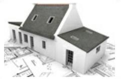
As Built Drawings